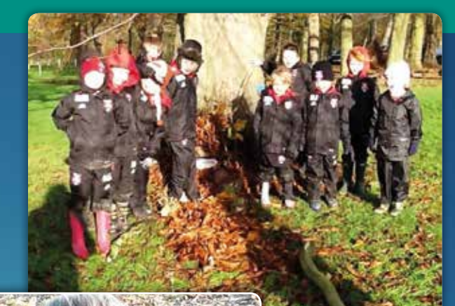
KS2 had a super time building shelters and dens.